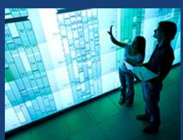
Social Equality and Cultural Understanding